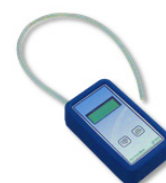
GF 1010 with Silicone Cover